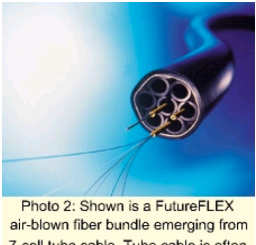
air-blown fiber bundle emerging from 7-cell tube cable. Tube cable is often installed with more cells than required to ensure capacity expansion.

In almost all ABF installations, tube cable is installed with more cells than are currently required to ensure room for expansion (see Photo 2 below).